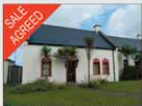
Garrettstown Coastal Cottages 4 bed holiday home