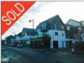
Shearwater, Pier Road · 4 bed apartment