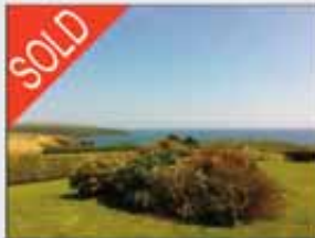
Ardkilly Ridge, Sandycove · 4 bed family home