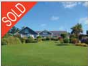
Clonard, Ardbrack · 5 bed family home