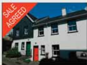
Rampart Mews · 3 bed terraced house