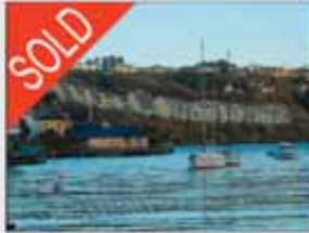
Ardbrack Heights, Ardbrack 2 bed apartment