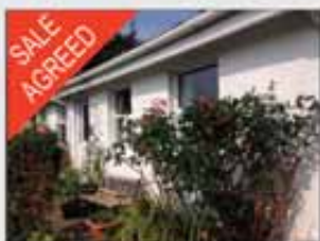
Ballinacubby · 2 bed terraced house