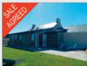
Killaneetig, Ballinadee · 4 bed family home