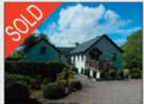
Rockfort, Innishannon · 4 bed family home