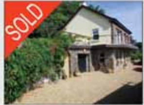
Beacon House, Compass Hill 4 bed family home