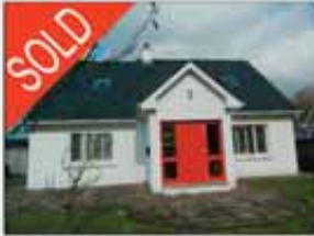
Ard na Mara, Cappagh · 4 bed family home