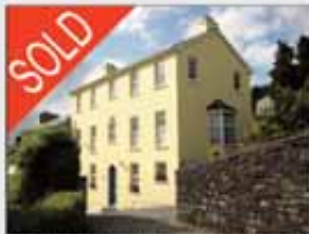
St. John's Hill · 3 bed family home