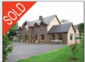
Barna, Innishannon · 4 bed family home