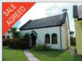
Garrettstown Coastal Cottages 4 bed holiday home

As your local estate agent with an international network, we can locate buyers nationally or across the seas. If you are thinking of selling your property this year, call Ron on 086 343 7729 for a free market appraisal.