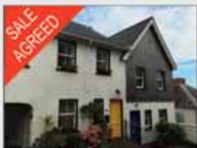
Rampart Mews · 2 bed terraced house